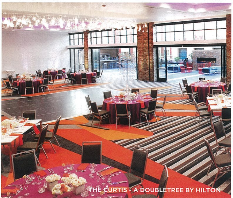
THE CURTIS - A DOUBLETREE BY HILTON