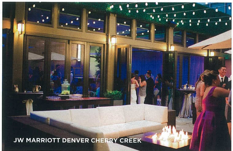
JW MARRIOTT DENVER CHERRY CREEK